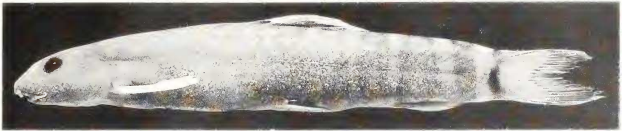
Fig. 2: Schistura sikmaiensis

crescent shaped. Upper lip very thin with no incision or furrows. A deep median interruption in lower lip, no median notch in the lower jaw. Processus dentiformes poorly